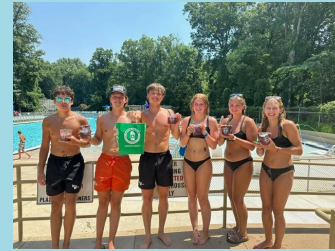
2023 Feed the Guards