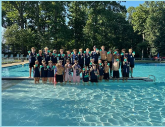
Crab Feast A-Team